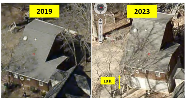
Figure 4: Elevation of Non-Compliant Home

The homeowner did find temporary living arrangements and rather than demolish the structure, elected to repair, and elevate the existing structure (Figure 4). The repairs were costly and time-consuming. The repairs began in 2019 and due to construction delays and the discovery of an unusable foundation, construction is ongoing as of July 2023. This is a 4-year recovery period for this homeowner. Is this resiliency?