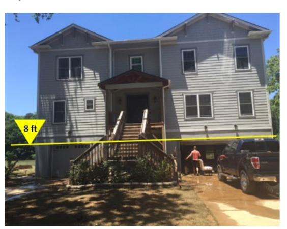
Figure 2: Compliant Home

counties away and twenty (20) of those homes were substantially damaged by the flooding (Figure 1). Most of the homes in the area were not required to be built compliant with floodplain standards current due construction date, but some homes were built (or rebuilt) compliant with current standards. This article compares recovery efforts from a non-compliant home (#1 in Figure 1) and a compliant home (#2 in Figure 1) and explores questions that local governments should consider, the answers to which can make communities floodplain resilient. When it comes to flooding, resiliency can be defined quite simply as the ability of a community to adjust and recover after a flood.